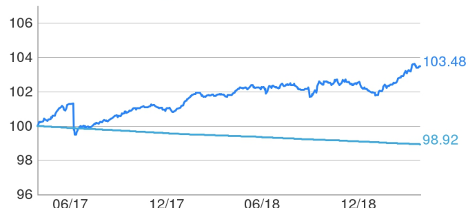
Sextant Bond Picking (A) ■ Euro Constant Maturity Treasury (CMT) cash 3Y